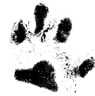
Moose, Winery Ambassador